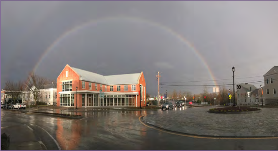
Ann Webster sent in this stunning picture of Middelbury's new town offices under a rainbow. They moved in the end of March and opened for business on April 4, 2016. The Town Clerk is now located at 77 Main Street. Webster said, "We are loving our new space!"