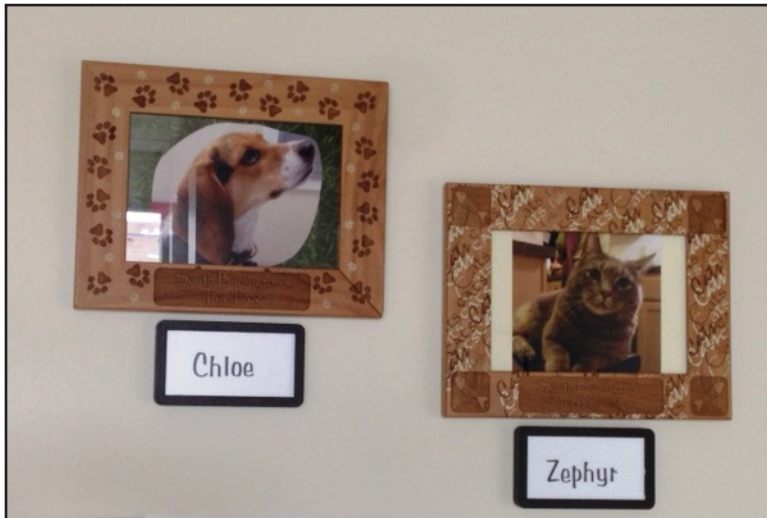
South Burlington's Top Dog and First Feline for 2014.