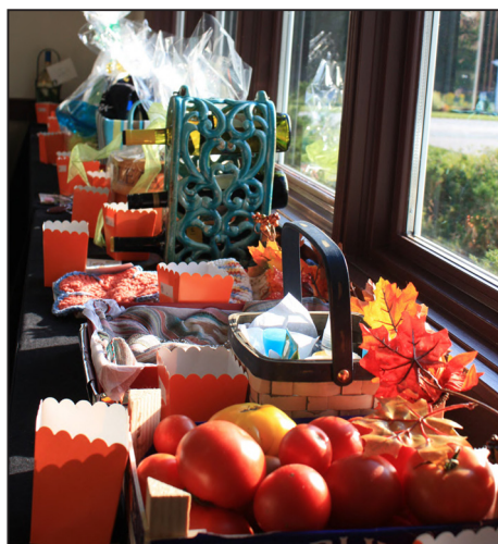
An array of baskets at the 2014 VMCTA Conference. Vermont baskets will also be featured at the 2014 NEACTC Conference on November 19-21.

The goal is to have 40 baskets ready to raffle in November.