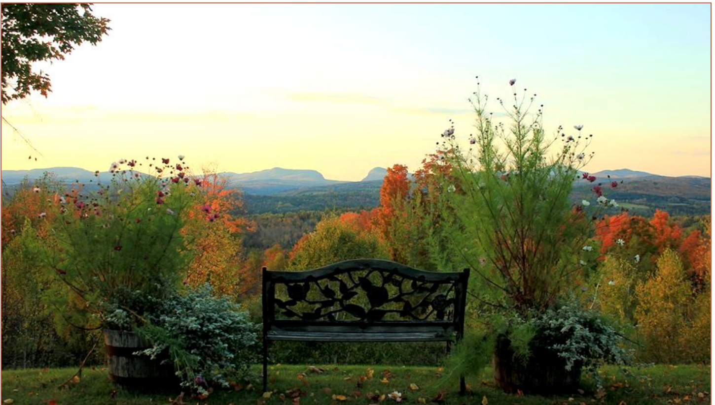
Best seat in the house on Burke Mountain.