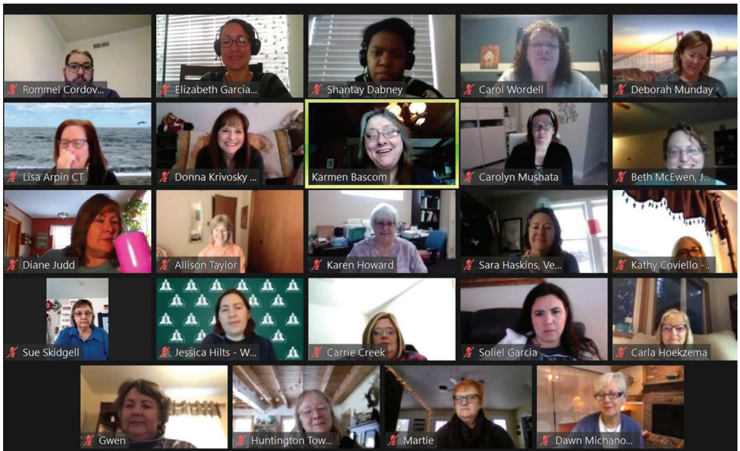
Online Athenian Dialogue

September 26 and 27, 9 am to 12:30 pm for THINGS YOU SAVE IN A FIRE by Katherine Center.