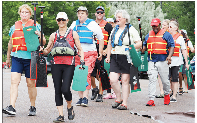
The determined Freedom & Unity 2023 Dragonboat team members march toward the pier to board their boat.

The Vermont Municipal Clerks and Treasurers have put together a dragon boat team for the Lake Champlain Dragon Heart Festival to be held Sunday August 3, 2024. This year's team includes Town Clerks from Wilmington, Royalton, Essex Junction City, Jericho and Killington. We did not have enough members to fill a whole boat, so our team Freedom & Unity will be paddling with The Love Boat. We will race together but we are fundraising separately. In the last two years, "Freedom & Unity" has raised over $9,000 in the festival. This money goes to support Dragon Heart Vermont and a pledge partner. Osher Integrative Oncology at UVM Cancer Center is this year's pledge partner.